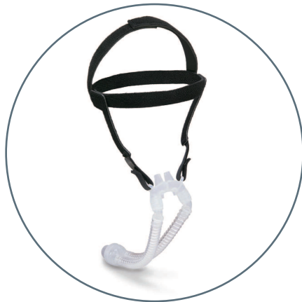
Nasal-Aire Petite with Micro ™ Headgear

Lightweight, soft, comfortable and quiet, the Nasal-Aire Petite is the smartest choice for your smallest patients.